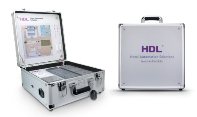
HDL Hospitality Demo Case without keycard

Fully equipped to represent the modern automated quest room, the HDL Hospitality Demo Case shows what can turn a good room into a great room. Geared towards easy room management and energy efficiency, the case contains a wide selection of sensors and panels as well as the revolutionary HDL RCU Guest Room Controller.