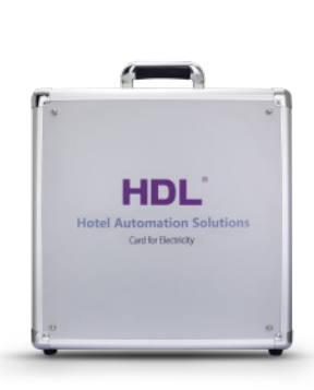
HDL Hospitality Demo Case with keycard