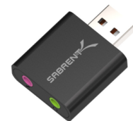
USB Audio Adapter (CT-2 only)