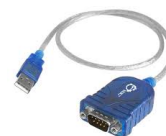
USB to serial Adapter