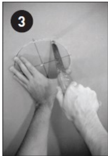
Figure 3 / 图 3