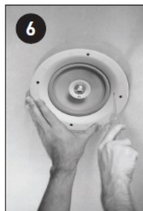
Figure 6 / 图 6