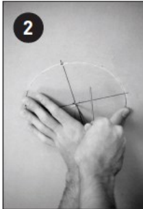
Figure 2 / 图 2