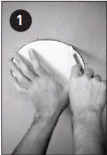
Figure 1 / 图 1

Issued: March 26, 2018 发布: 2018年03月26日 Edition V1.0